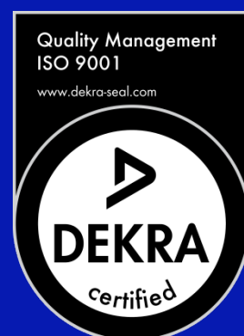
Seal of Approval for Quality Management