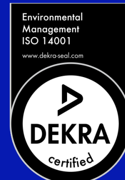
Seal of Approval for Environmental Management